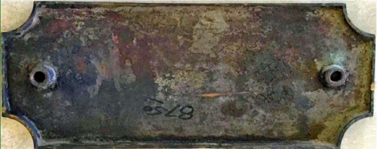
Rogers construction number 3157, 1882 New York West Shore & Buffalo #76 4-4-0