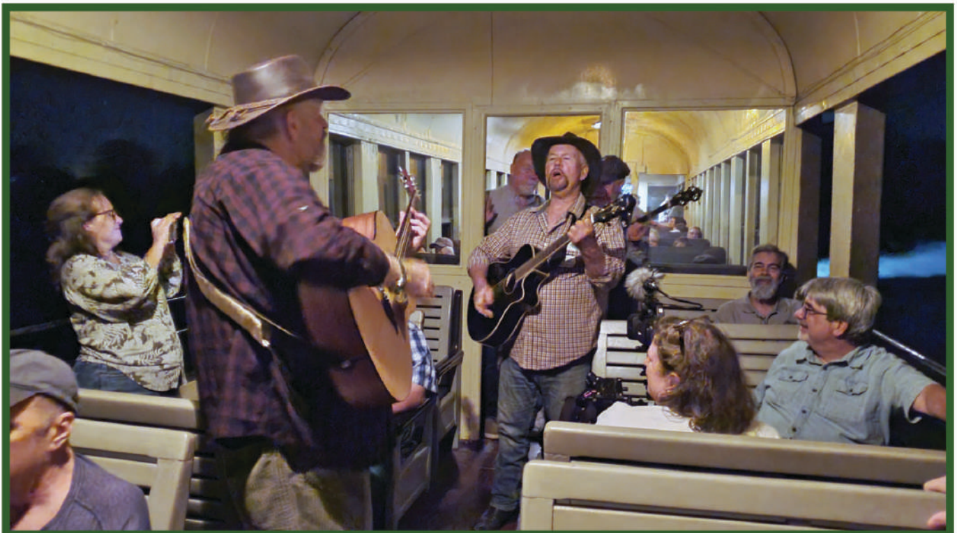
THE BLACK IRISH BAND ENTERTAINS PASSENGERS ABOARD THE PRESERVATION SUNSET LIMITED.