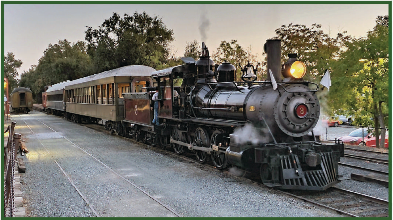
THE PRESERVATION SUNSET LIMITED SITS IN FRONT OF THE JAMESTOWN FREIGHT DEPOT.