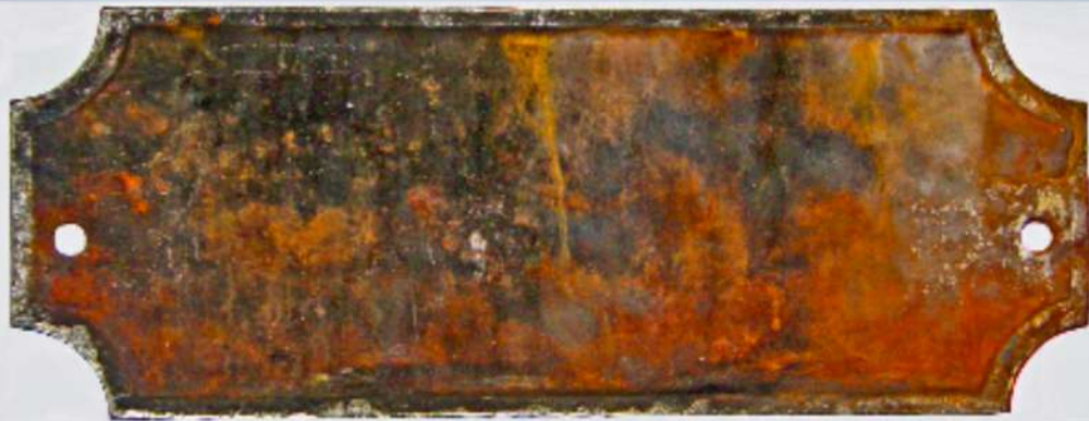
Jackson-Best 1948 Sierra #3 replica Rogers plate 11-2009