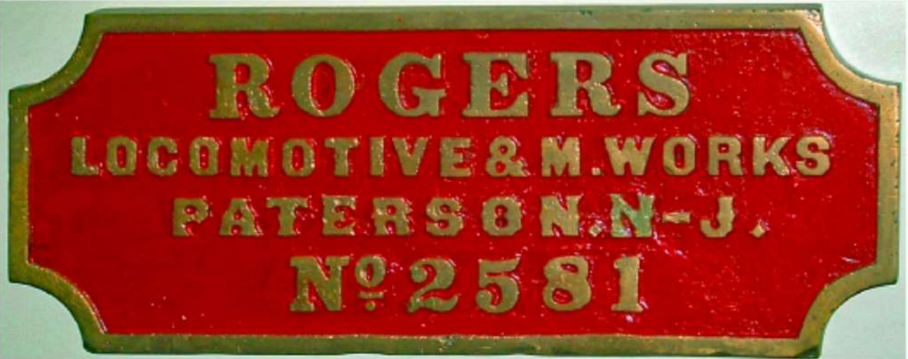
Rogers construction number 2581, 1880 Nashville Chattanooga & St Louis #11 4-6-0 Railroad Museum of Pennsylvania