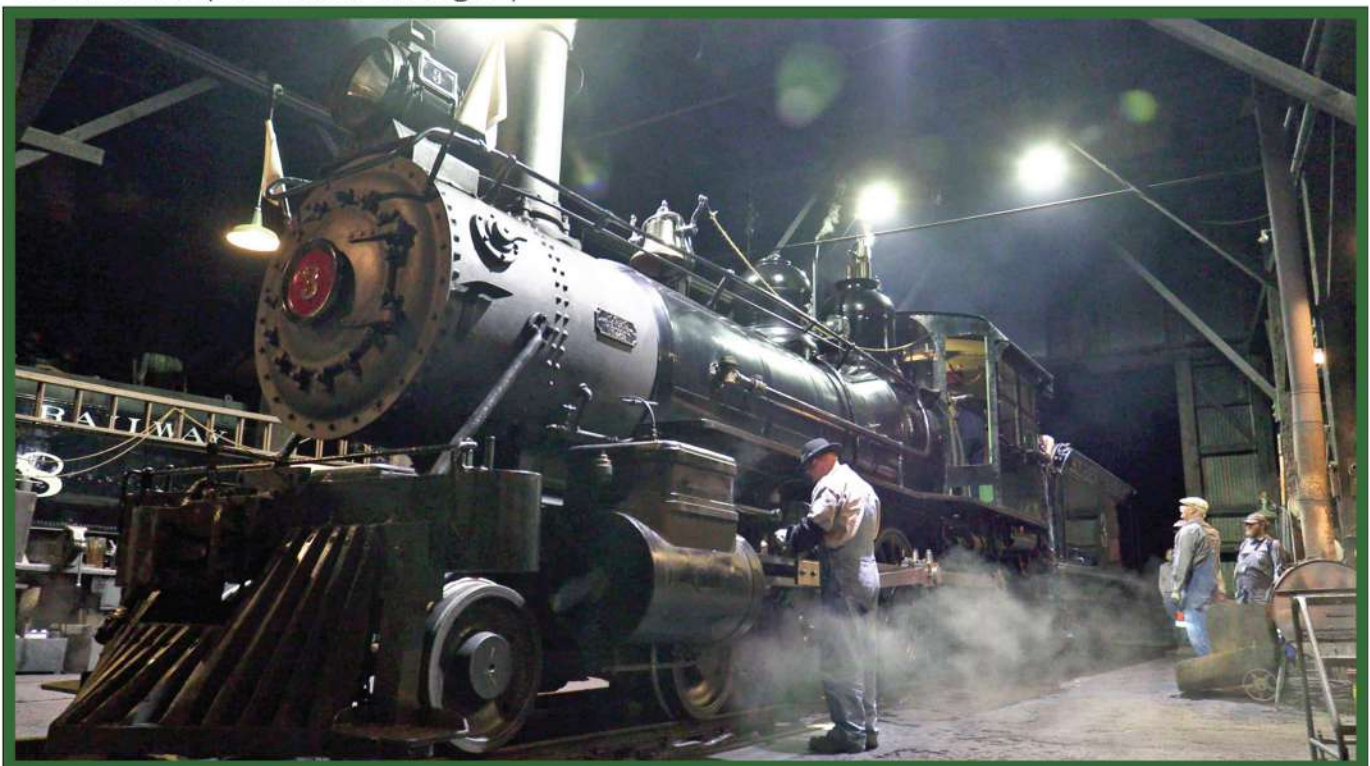
SIERRA RAILWAY #3 BACK IN THE ROUNDHOUSE AFTER THE PRESERVATION SUNSET LIMITED.

Our PRESERVATION SUNSET LIMITED barbecue dinner and train ride on September 26, 2025, was a big success. Photos and information about it can be found on pages 4 and 5 of this issue. (Continued on Page 2)